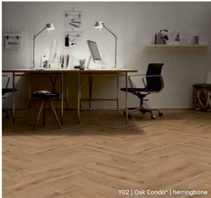
Y02 | Oak Condo* | herringbone

Y02 1101021803 | 665x133x10 mm | herringbone