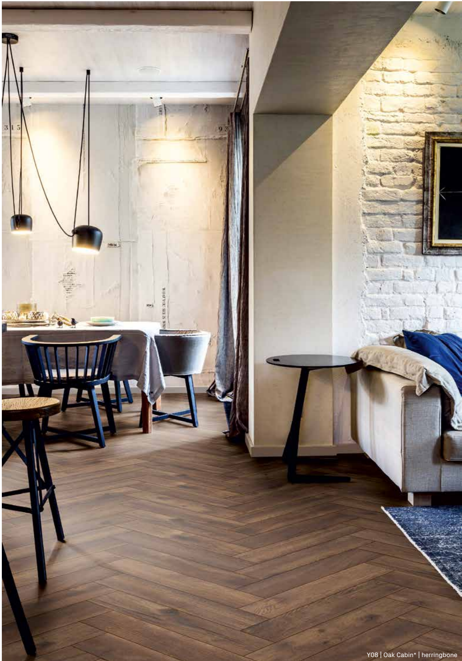
Y08 | Oak Cabin* | herringbone